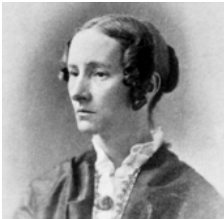
Anna B. Warner, the author of "Jesus Loves Me!"