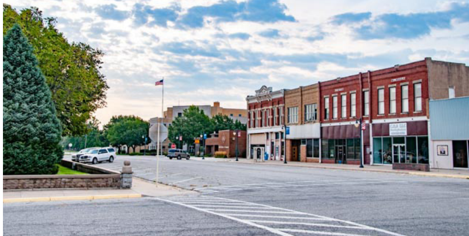
Downtown St. John, Kansas

Last Sunday at St. John was unique. Due to the national emergency, we had to take precautions such as leaving an empty row between pews and having the men serving the communion wear gloves. We also broadcast our Bible class and worship online. (This is called Live Streaming.)