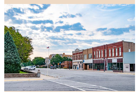
Downtown St. John, Kansas