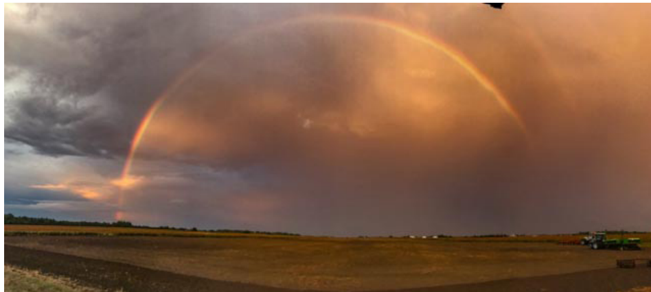
A rare full-double rainbow over Stafford last fall