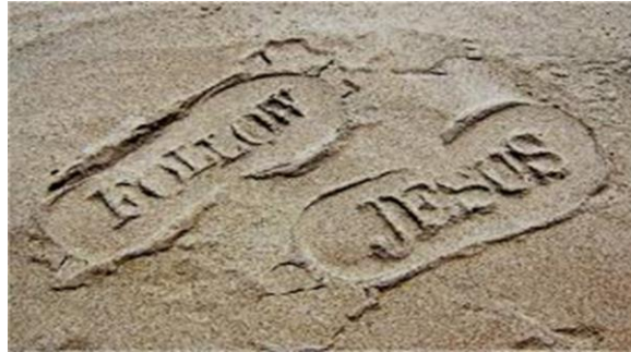
St John Church of Christ A Family of God September 11, 2016