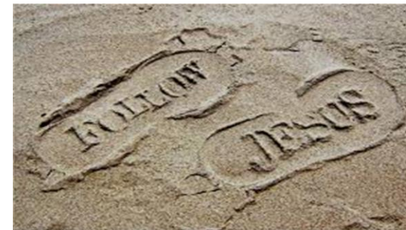
St John Church of Christ A Family of God

Where belonging to God means belonging to each other.